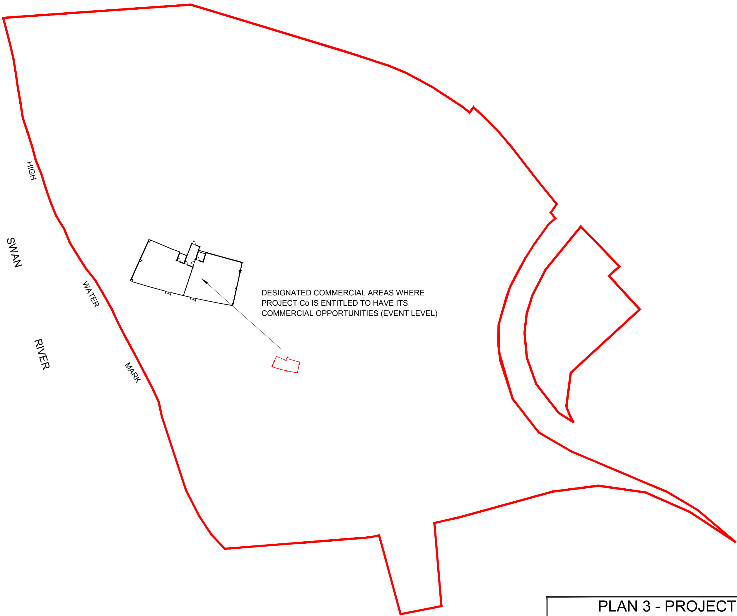
PLAN 3 - PROJECT Co COMMERCIAL OPPORTUNITY